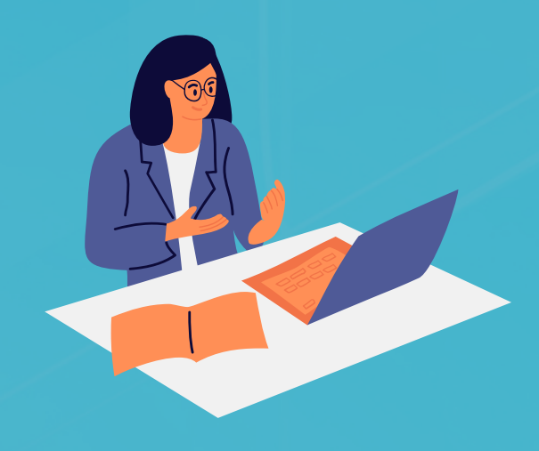
Coaching & Support

We will facilitate the quarterly assessment and grading procedures.