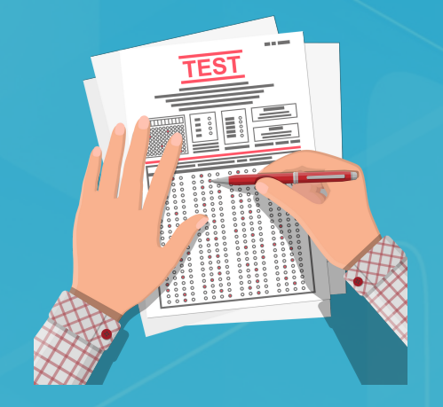
Exams and Quizzes

No more hassle preparing your own exams and quizzes.